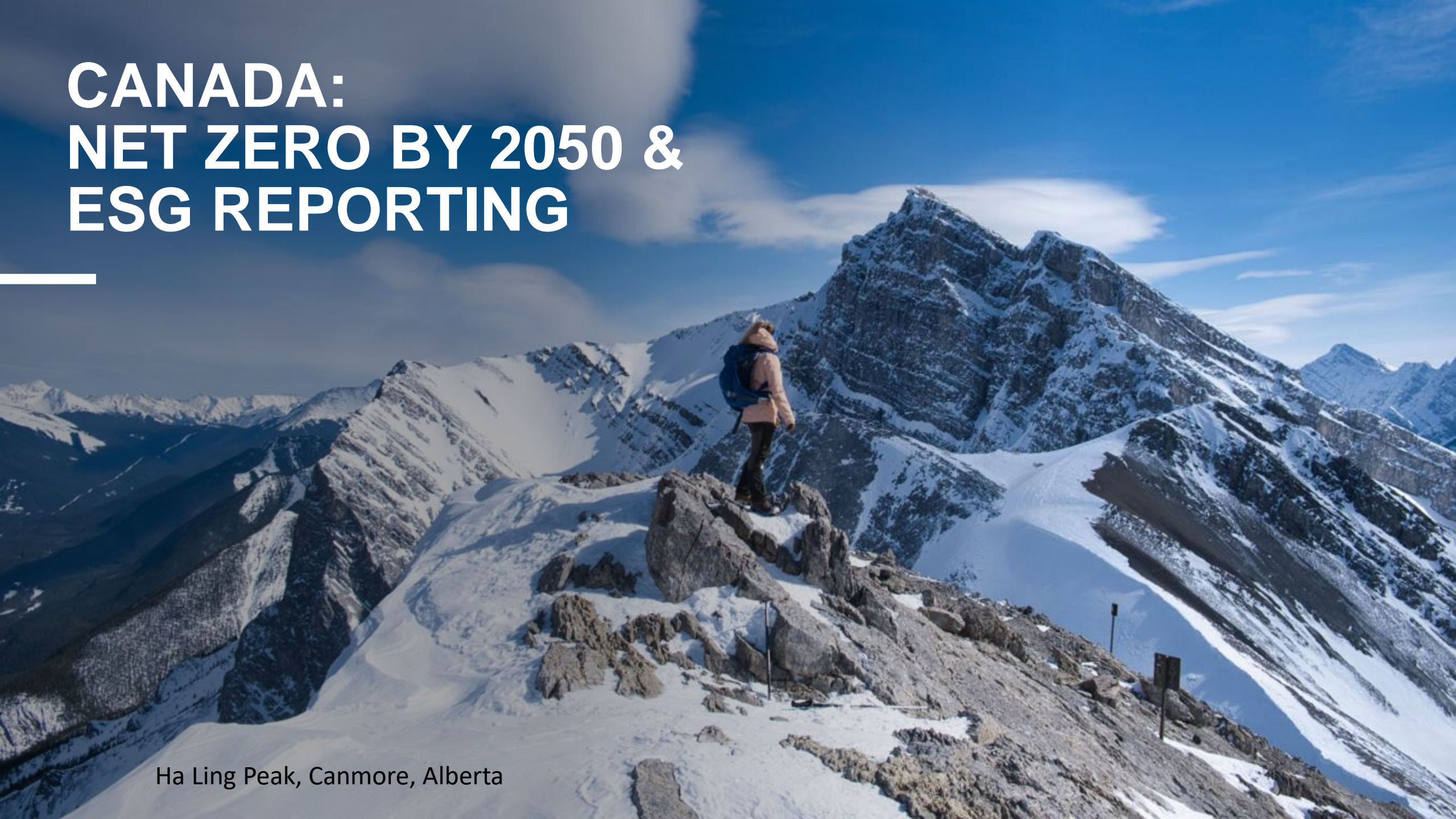
Ha Ling Peak, Canmore, Alberta